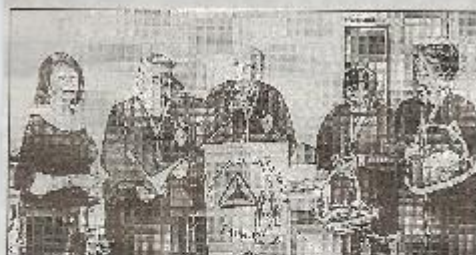
La Confrérie du Chaoudelet